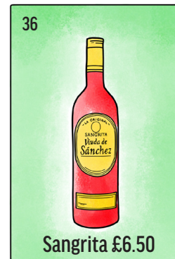
Arette Tequila + Viuda de Sanchez